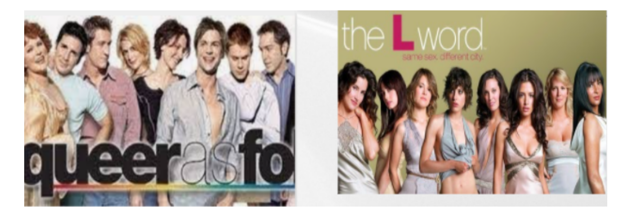
Figure 4. Our first positive representations of LGBTQIA+ members

Diego. As a kid, it was clear that representations of masculine and feminine were conceived and promoted from a binary perspective; my family followed the standards of the time where certain things were related to boys and other to girls; between --eliana d. and I the situation was not so different. We both grew up with a tendency to like all types of games, roles and activities. However, there is a distinction between how we conceived and accepted; I always was afraid of showing my interest in showing things related to girls, on the other hand, for --eliana d. was an opportunity to challenge the perception of others. She saw herself as a strong woman who was not afraid to express her likes. As an adult, I see the importance of having these representations in media, and the moment that people live right now; we have the chance to understand about LGBTQIA+ in an indirect way; we have lots of role models in music, TV, movies and social media. We see the improvement in these representations, and I also admire those that in my time decided to start showing some kind of representation. Although it was not necessarily right it was the first step to start this revolution and trace the path in a context traditionally wrong about the idea of being LGBTQIA+. We decided to include the category of LGBTQIA+ representations because from queer critical literacy we can